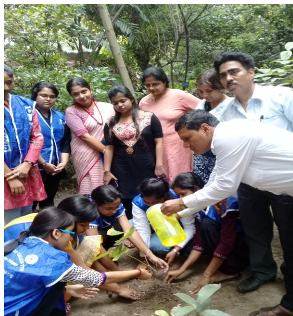
Tree Plantation by NSS Unit in Bethune College premises on 14.11.2017