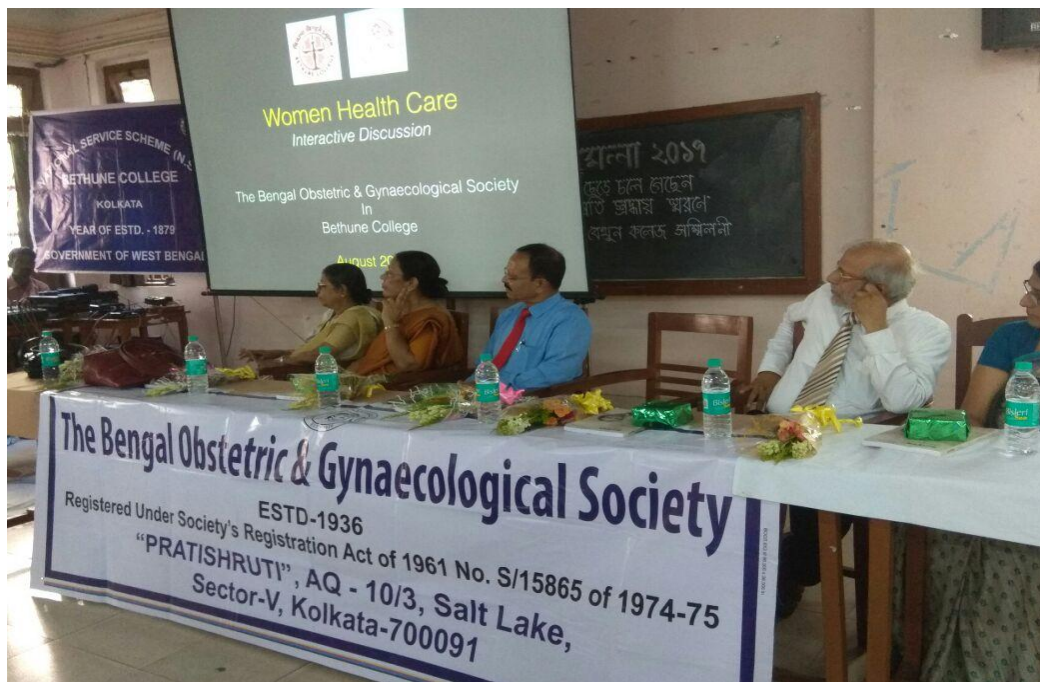
Members of the Bengal Obstractive and Gynaecological Society, Kolkata in Bethune College on 25.08.2017