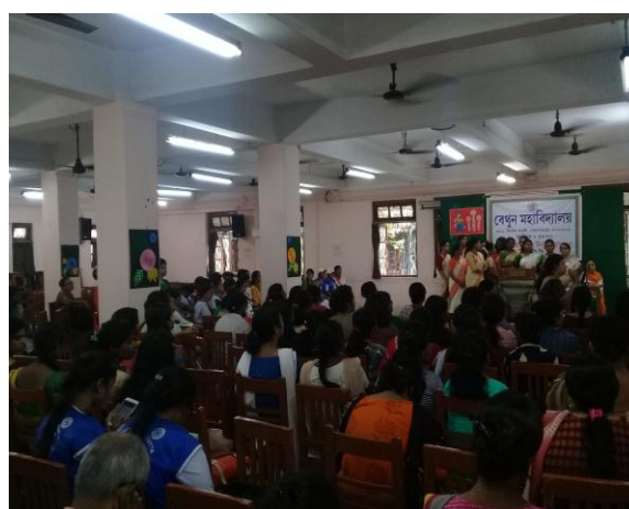
NSS Unit of Bethune College participated Cultural Programme on Independence Day, 2017