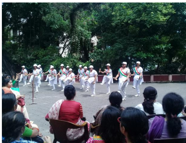
March-past Programme on Independence Day, 2017 at Bethune College Campus