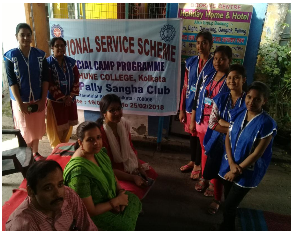
NSS Volunteers and NSS committee members in Slum Area at Pally Sangha Club, Near Girish Park Thana on 19.02.2018