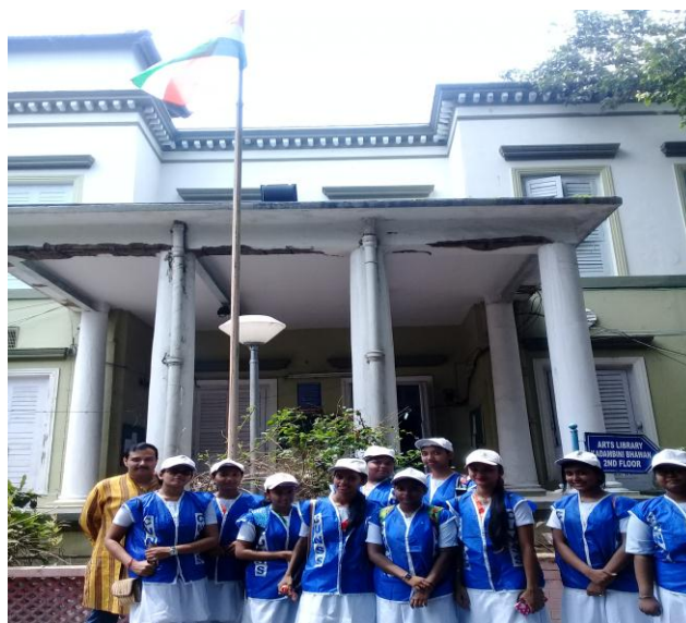
National Flag hosting on Independence Day at Bethune College premises on 15.08.2017 at 9.30am