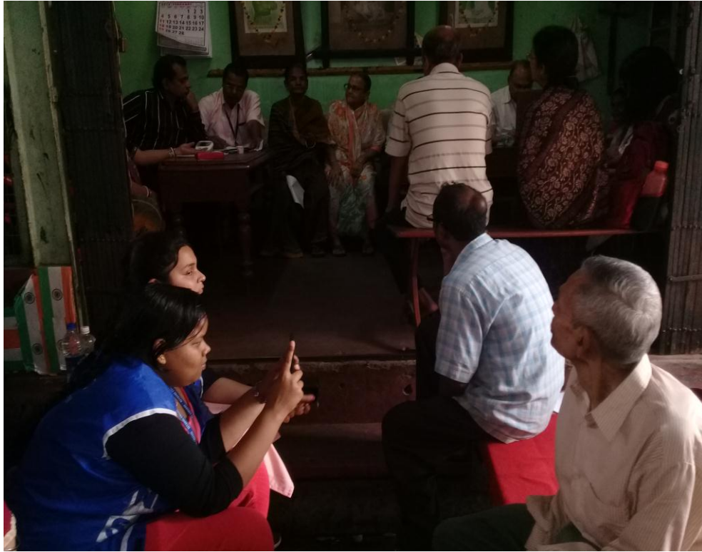
Patients are waiting at slum area at Pally Sangha Club on 22.02.2018