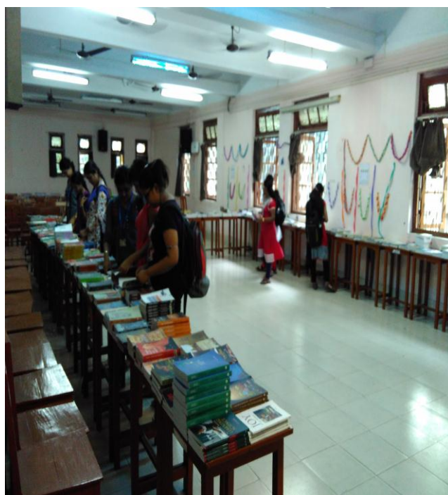
A BOOK EXIBITION CUM SALES AND BOOK PROMOTIONAL ACTIVITIES ON 10.09.2015 & 11.09.2015 FROM 11 AM TO 5 PM.