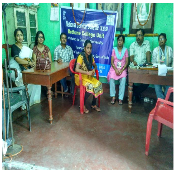
Medical team at Slum area with NSS Members