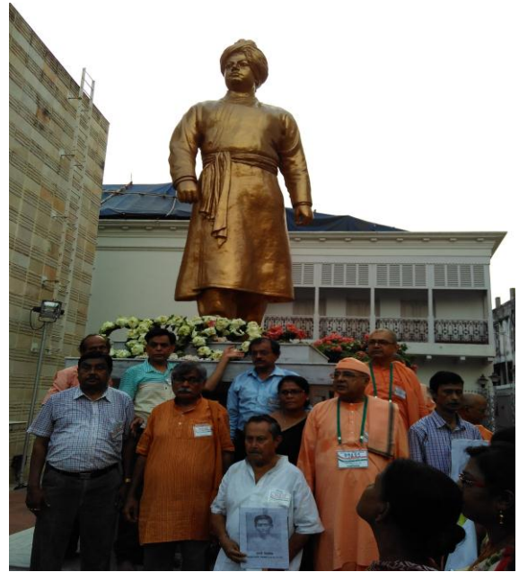
BALLESWAR BATTLE RALY PROGRAMME ON 7 TH SEPTEMBER, 2015 ORGANISED BY BALLESWAR MARTYRDOM REMEMBRANCE COMMITTEE