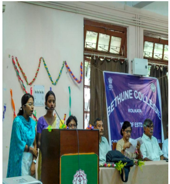
BALLESWAR BATTLE SHORT FILM ON 08.09.2015 AT 3P.M. AT CENTENARY HALL, BETHUNE COLLEGE ORGANISED BY NSS UNIT