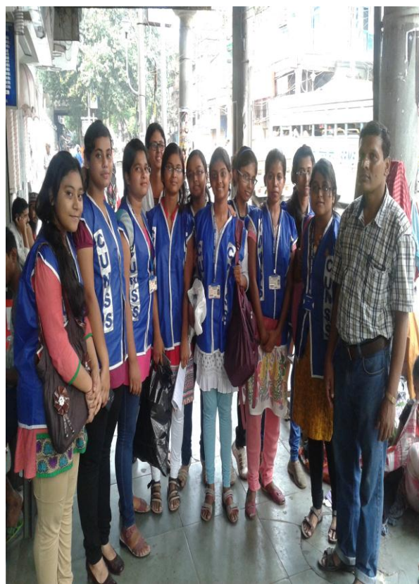
OLD CLOTHS DISTRIBUTION TO SLUM DWELLERS AT GOABAGAN AREA AND FOOTPATH DWELLERS ON 14.09.2014