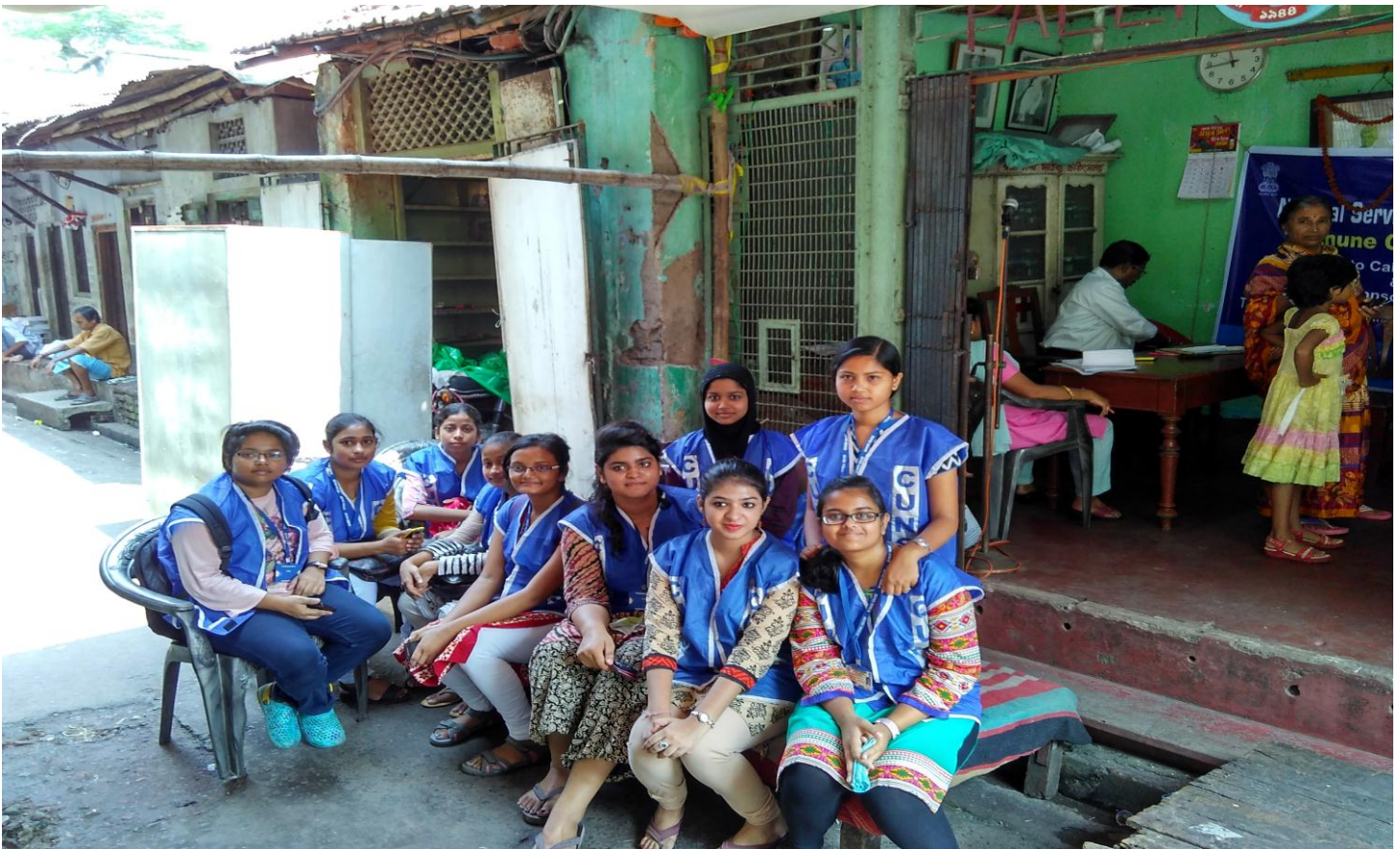
NSS volunteers at Slum Dwellers

Special Camp from 03.10.15 to 09.10.15 at Pally sangha Club, Ramdulal Street, Kolkata 700006