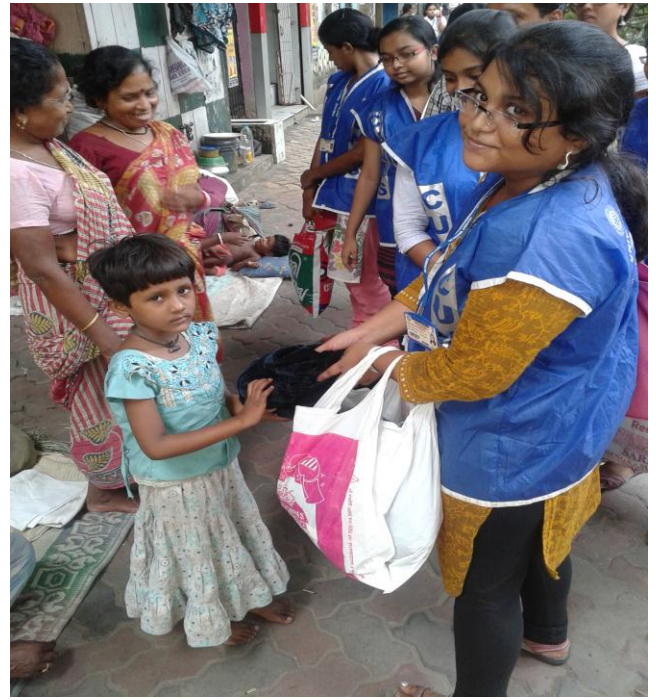
OLD CLOTHS DISTRIBUTION TO SLUM DWELLERS AT GOABAGAN AREA AND FOOTPATH DWELLERS ON 14.09.2014