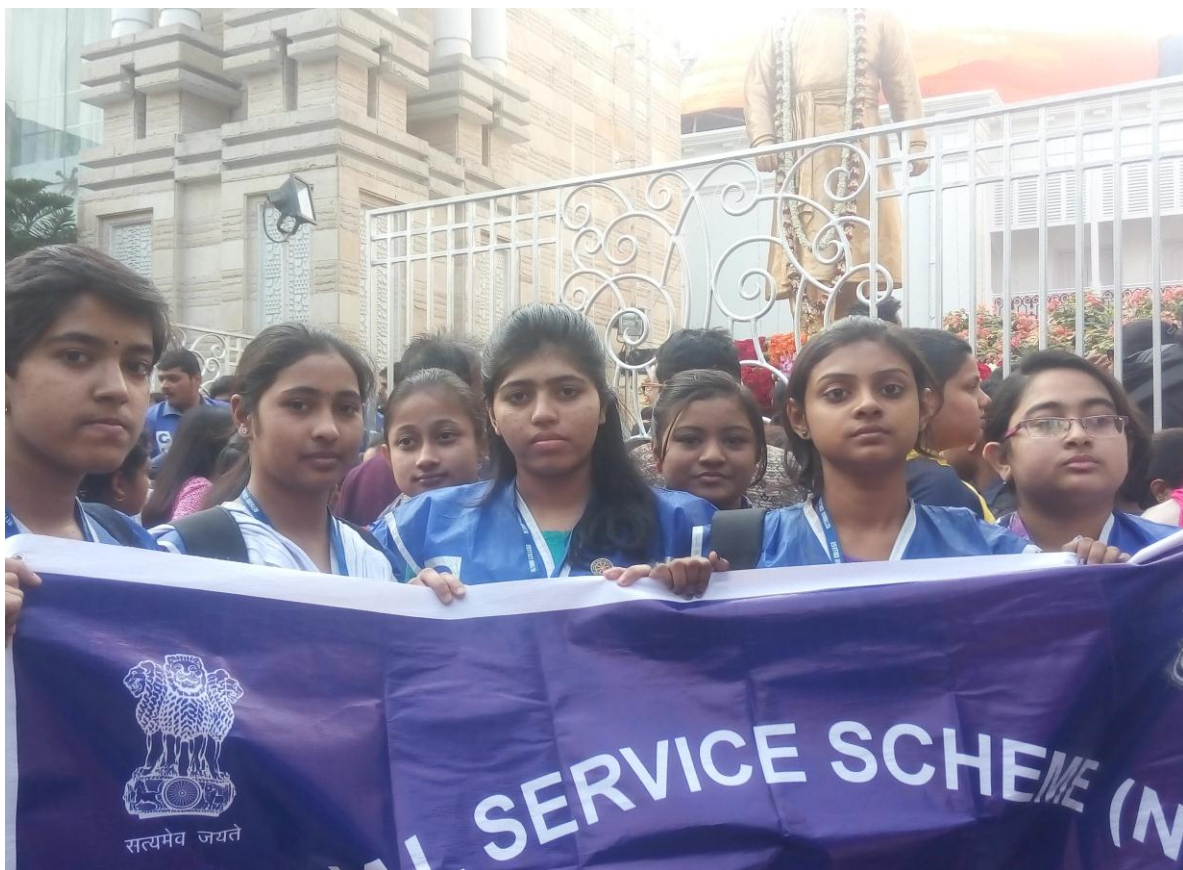
Participation NSS rally on 12 th January, 2015 organized by NSS Unit, University of Calcutta to commemorate the birthday of Swamiji