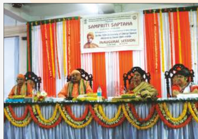
Dignitaries with Principal during the Inaugural session of Sampriti Saptaha

Heritage: The multidisciplinary journal of Bethune College, Heritage (ISSN 2349-9583) is published annually since 2014. The journal covers a diverse range of subjects catering to an eclectic readership and is exceptionally suited to the needs of academic research and praxis. It has a dedicated webpage accessible from the college website where all information regarding the journal is available. The