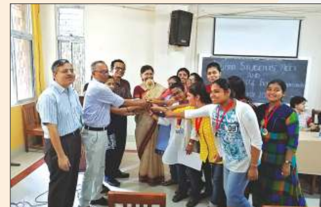
Intra-College Champions Trophy 2018-19 won by students of the Physics department