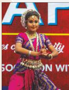
Eastern Dance Performance at Aalap 2018