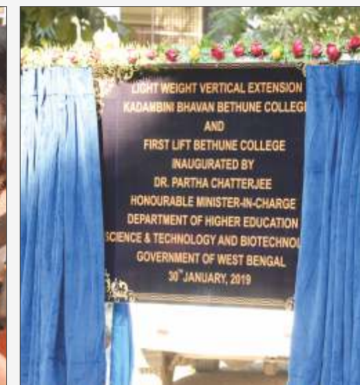
Hon.ble MIC Dr. Partha Chatterjee inaugurating the new infrastructural facilities in the College, 2019