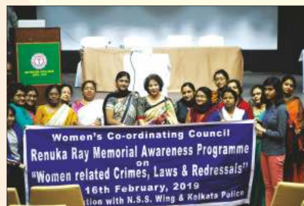
Awareness Programme organised by NSS Unit of the College in collaboration with Women's Coordinating Council and Kolkata Police

Admission process is conducted online through the website www.bethuneadmissions.ac.in . The candidates have to submit forms online. A candidate can apply for a maximum of four different Honours subjects. Separate application forms must be submitted for each Honours subject.