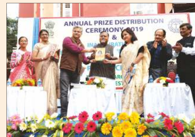
Formal Release of College magazine Adiganta by Hon'ble MIC, Dr. Partha Chatterjee on Annual Prize Day, 2019

The college has an Internal Complaints Committee constituted according to UGC Notification (Prevention, Prohibition and Redressal of Sexual Harassment of women employees and students in higher educational Institutions Regulations, 2015) to prevent and take appropriate action against sexual harassment of women in the institution. This