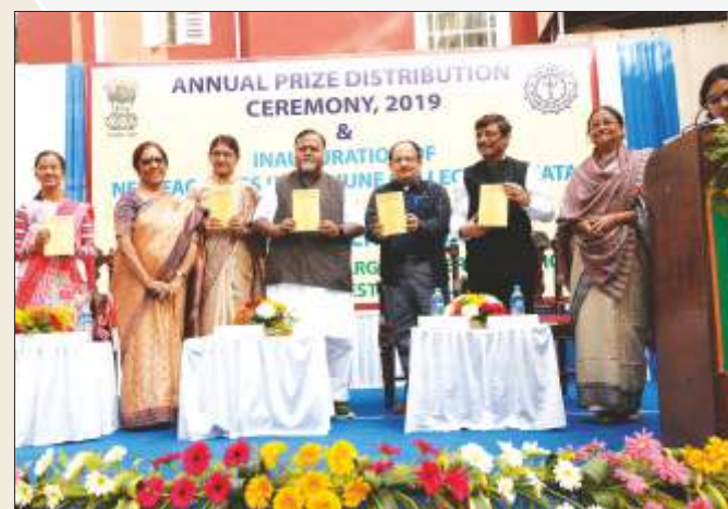
Formal Release of In the Footsteps of Chandramukhi by Hon'ble MIC, Dr. Partha Chatterjee on Annual Prize Day 2019

In accordance with the Government rules, Bethune College has a Governing Body constituted by nominees from the Government of West Bengal, Calcutta University, teaching staff, non-teaching staff and students. The Body meets at regular intervals and their guidance helps the smooth running of the college administration and the welfare of students.