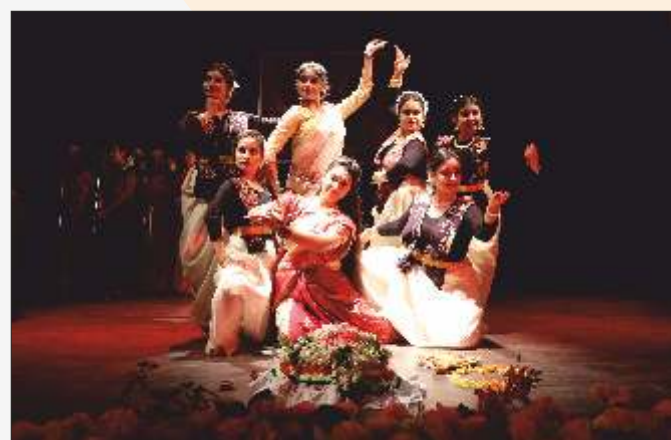
Cultural Programme by students