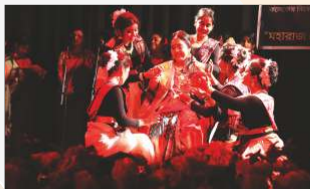
Dramatic Rendering of Tagore's 'Pujarini' on Rabindra Jayanti 2019