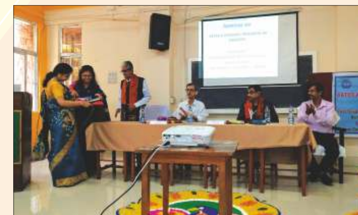
Seminar organised by PG department of Zoology

Admission is done strictly on the basis of merit. The entire process of admissions will be conducted online. The admitted candidates will come to College on the first day of commencement of class which is also the Orientation Day.