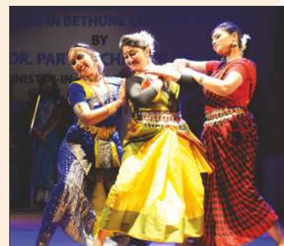
Cultural Programme on Annual Prize Day 2019

End Semester Examinations will be held for 80% of the total marks in each paper and Internal Assessment shall be for