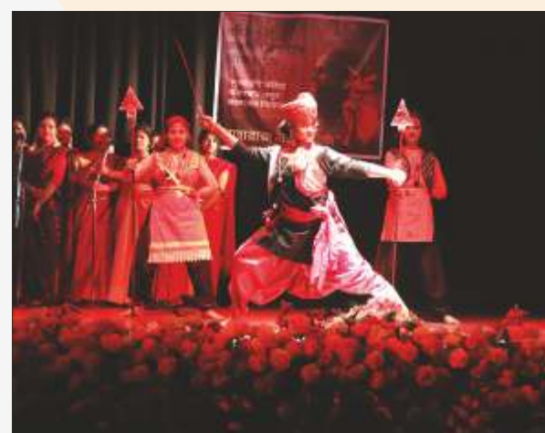
Rabindra Jayanti Celebration 2019

The procedure of admission to the three-year degree course starts after publication of the results of Higher Secondary Examination conducted by the West Bengal Council for Higher Secondary Education. The merit list is published in the College website.