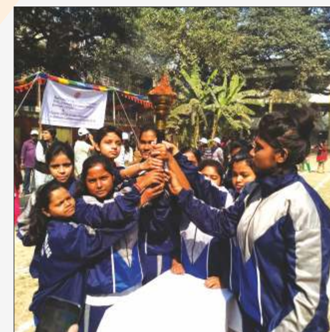
Torch Lighting Ceremony at Annual Sports 2019