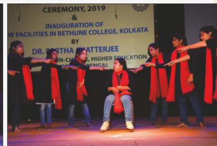
Street Play on Annual Prize Day 2019