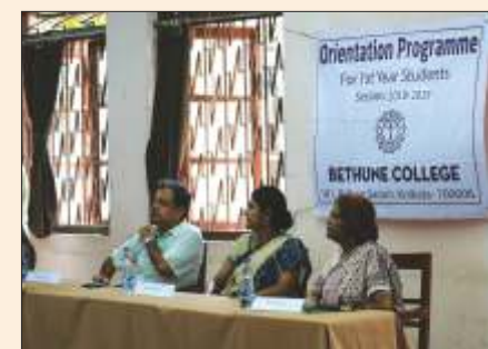
Dignitaries with Principal during Orientation Programme, 2018