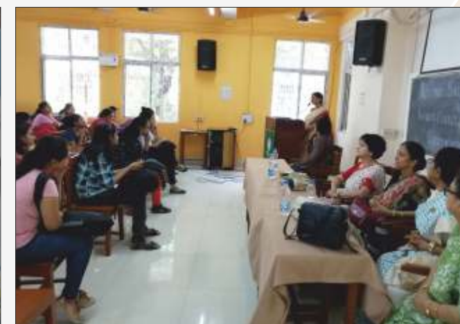
Alumnae-Students' Meet 2019