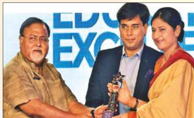
The Principal, Bethune College receiving the Award of Academic Excellence 2019 by ZEE 24 Ghanta from the Hon'ble MIC, Dr. Partha Chatterjee

The College organizes the Annual Sports in its own play ground in the month of December every year. Besides this, the College also participates in various inter-college and district-level sports events and has many prizes to its credit.