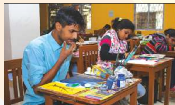
Participants during Poster-making Competition at Aalap 2018