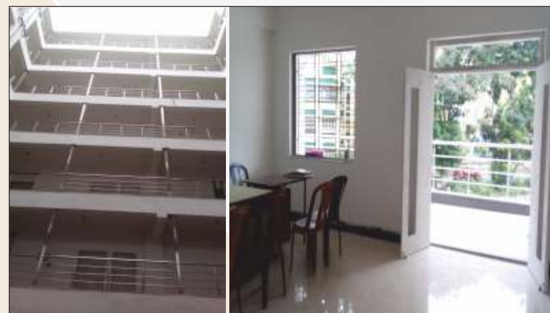
Newly constructed Hostel Building of the College which is to be inaugurated shortly

Students are eligible to apply for seats at Calcutta University Undergraduate Girls' Hostel. The construction of New Girls' Hostel with 136 seats has nearly been completed at a prime location in the vicinity of Karunamoyee Salt Lake which will be inaugurated shortly.