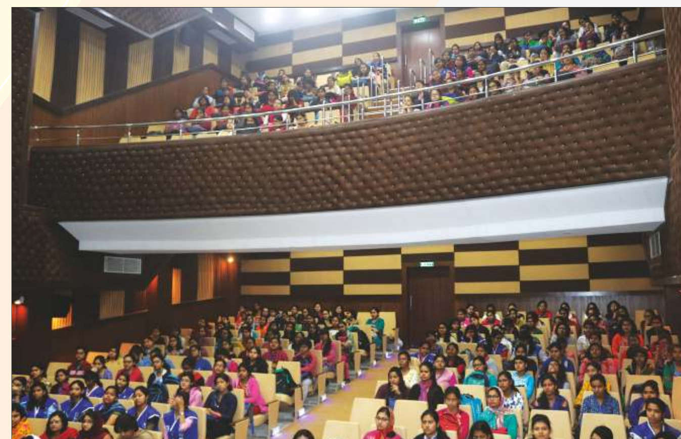
The newly inaugurated College auditorium