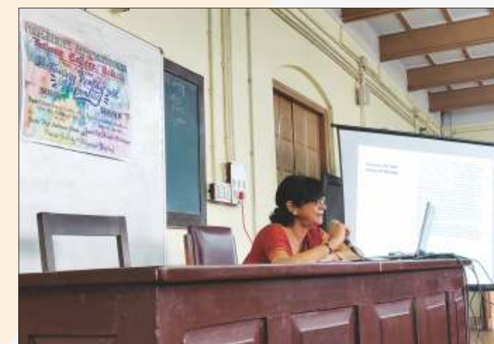
Seminar organised by PG department of English