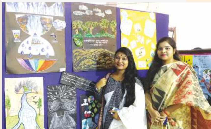
Exhibition on Water-Creation, Crisis and Conservation on Bethune Day 2018