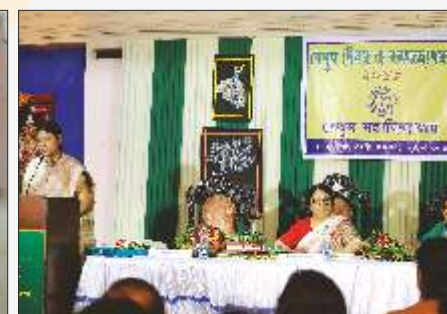
Principal's address on Bethune Day 2018 in the presence of celebrated author and IAS Smt. Anita Agnihotri