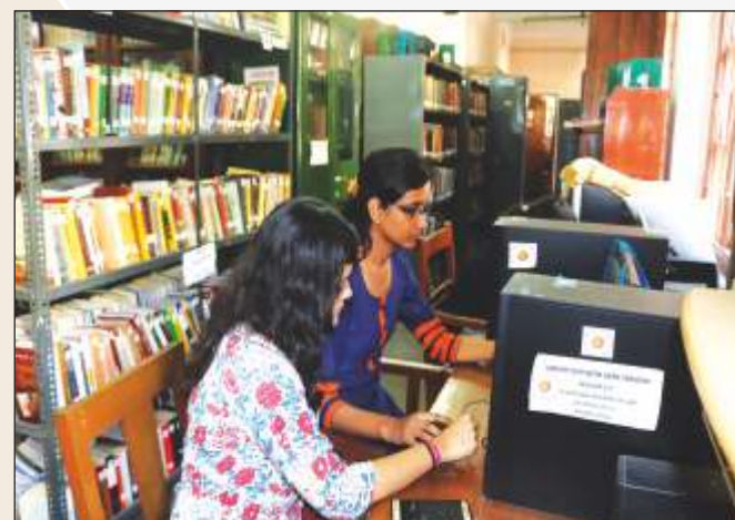
Internet facilities in the College Library

There is a separate archival section in the Arts library. Being the first Women's College in India with a long and glorious history, the institution has preserved a huge number of rare historical documents in the archive.