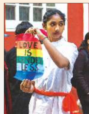
Participant during Street Play Competition at Aalap 2018