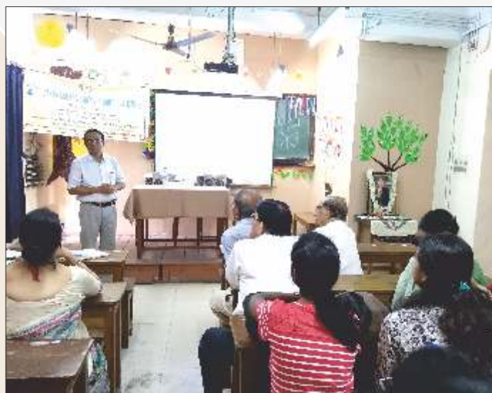
2nd Sanghamitra Sanyal Memorial Lecture organised by Botany Department, 2019

The students do commendably well in University examinations and are often rank holders. Most students pass out with first class degree in M.Sc examinations as well as qualify for various competitive examinations like NET, GATE and RET. Students have been recipients of various scholarships and prizes. The Department provides constant support to the students to pursue a career in higher education and research both in India and abroad.