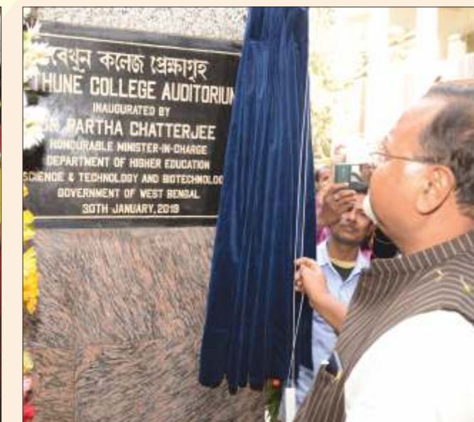
Inauguration of College Auditorium on the Annual Prize Day 2019